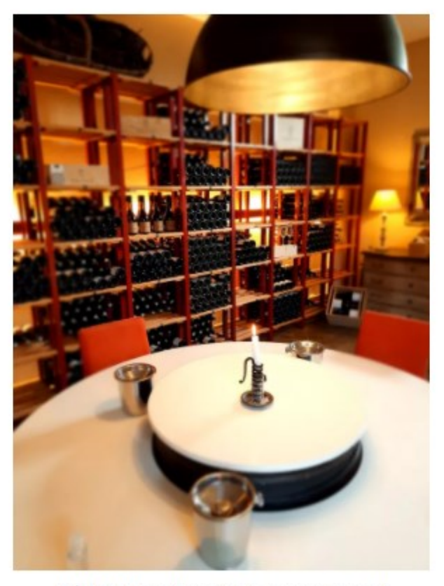
Dégustation au caveau. Comte Senard

« Ne passez pas à côté de ce domaine blotti au centre du village d'Aloxe-Corton, à la frontière entre la Côte de Nuits et la Côte de Beaune. Lorraine Senard tient les rênes de la propriété de 10 hectares (dont 5 hectares en grands crus), répartis principalement sur la Colline de Corton. Différentes dégustations sont possibles au caveau (sur réservation de préférence) : le forfait essentiel (4 vins dont 1 régional, 1 village, 1 premier cru, 1 grand cru) ou connaisseur (la découverte de 6 climats de Corton grand cru).