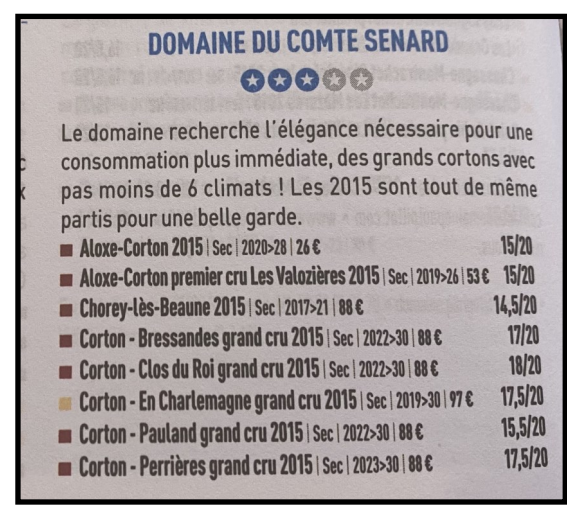
Guide des vins bettane et desseauve 2018, page 494

« Entre tradition et modernité, Lorraine Senard-Pereira a entrepris depuis 2005 des changements radicaux afin de procurer à ses vins l'élégance nécessaire pour une consommation plus immédiate, tout en préservant le potentiel de garde et la qualité intrinsèque des grands cortons, dont le domaine possède aujourd'hui une représentation sur pas moins de 6 climats! En rupture de style avec le puissant 2015, 2016 montre des tannins très fins. Bravo également pour le bourgogne blanc ana, sans bien sûr l'intensité du corton charlemagne. Il permettra de l'attendre sans impatience. On est proche de la quatrième étoile ».